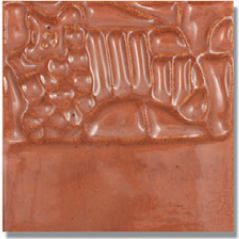
El-127 Rose Granite