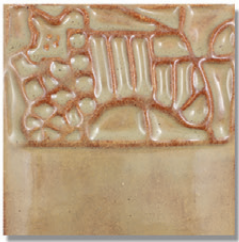
El-125 Sahara Sands