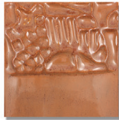
El-126 Coral Reef