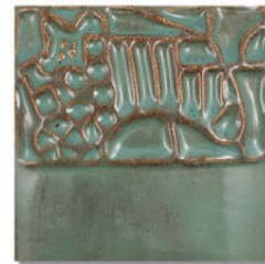
El-130 Sea Green