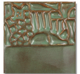
El-131 Turtle Shell